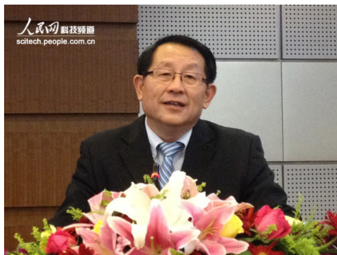
Dr. WAN Gang, Vice Chair of CPPCC, Minister of Science & Technology and President of CASTED addressing the 30th Anniversary of CASTED on Dec.19,2012